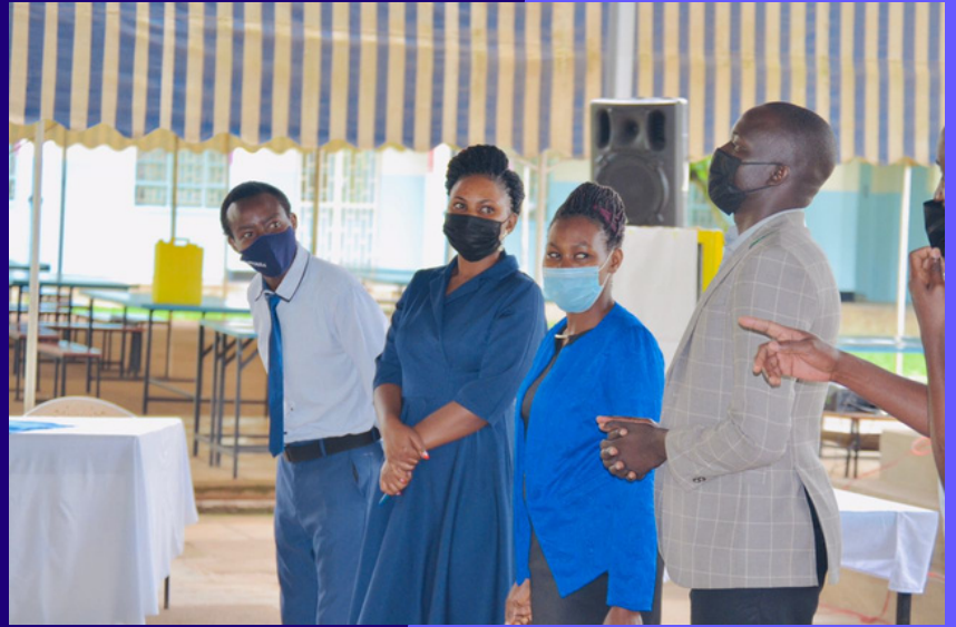
The teachers have reported back and busy in an in-service training session