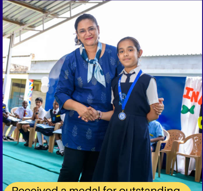
Received a medal for outstanding Prefect 2022/2023