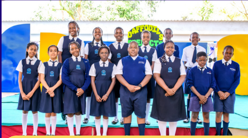
The Out-Going Prefects