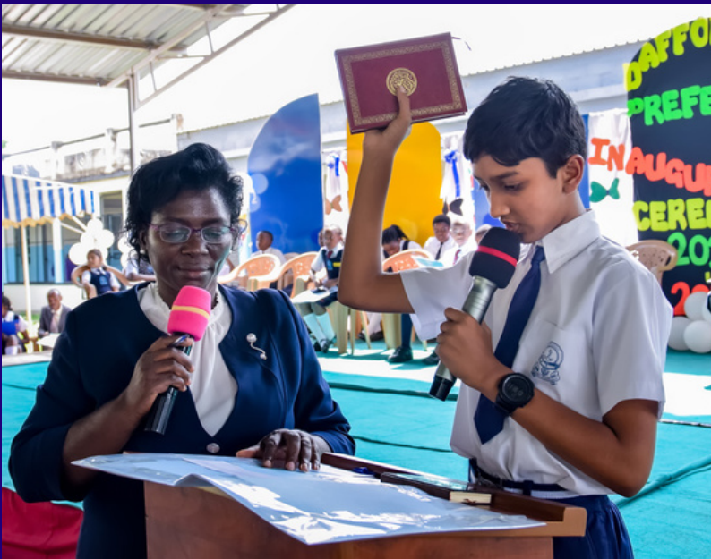
The New Prefects 2023/2024 Swearing-In