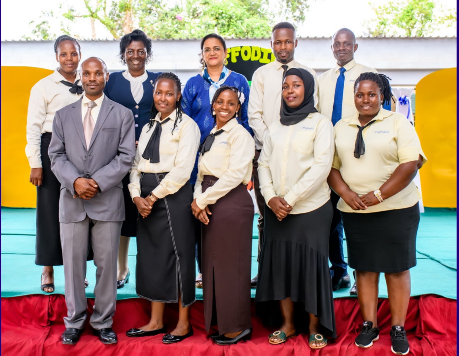
The Daffodils Electoral Commission with The Director and Chief Guest