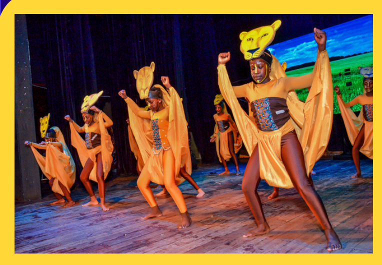
The Lion King by Daffodils Young Artists Society