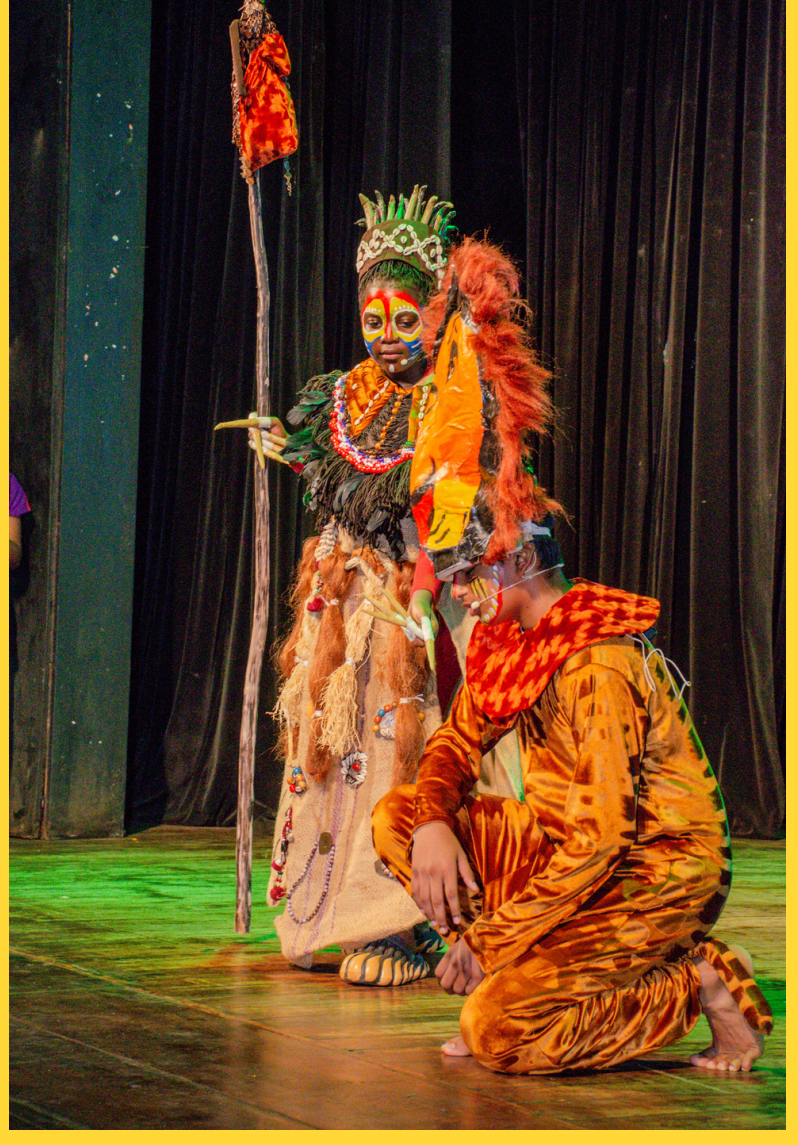
Daffodils Education Services, Ltd.