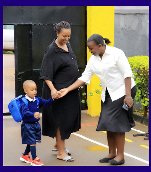
Learning more about the school!