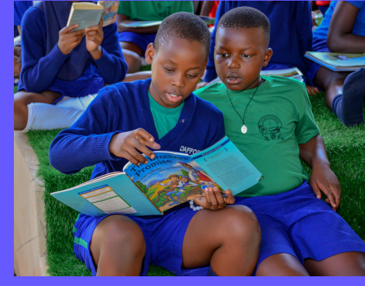
Drop Everything And Read! (DEAR)