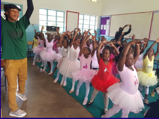
DANCE AND BALLET